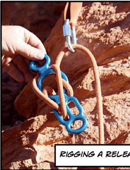
RIGGING A RELEASABLE FIGURE EIGHT.