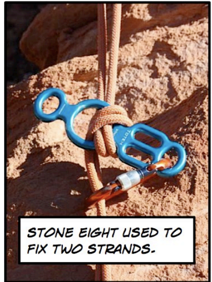
STONE EIGHT USED TO FIX TWO STRANDS.